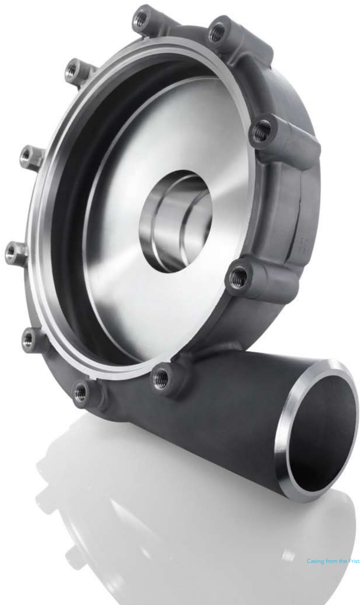
Casing from the Fristam FPH